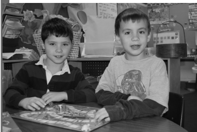
First grade students explore the exciting math activities in their new "Take Home Math Bags".