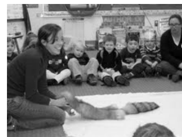
Preschoolers learn about local hibernators at a recent Stony Brook Wildlife presentation.