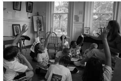
Third graders spend time studying the past in the Wrentham Center Cemetery and at the Old Fiske Library during their recent school fieldtrip.