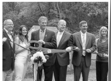
A ribbon cutting ceremony was held for the garden in June.